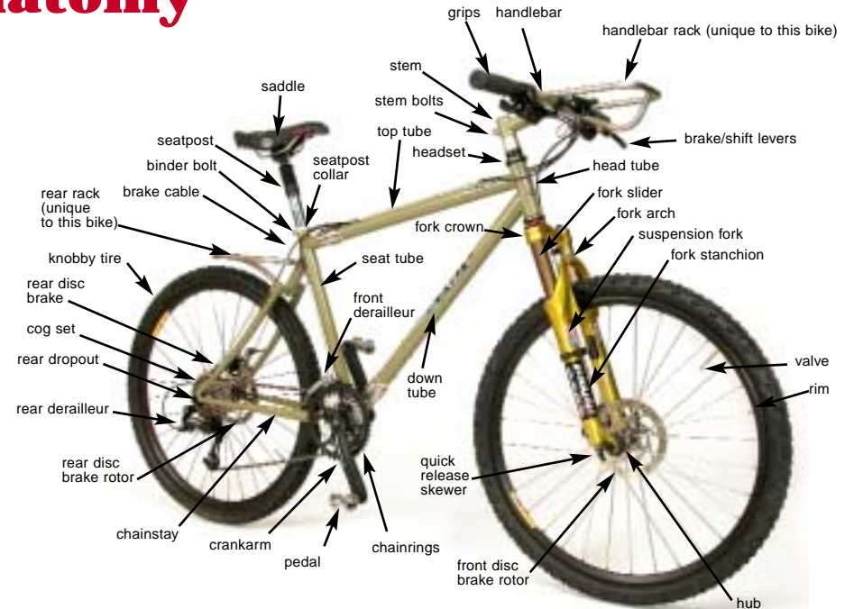
A typical mountain bike

worry—most tires have some irregularity and it won't affect performance.